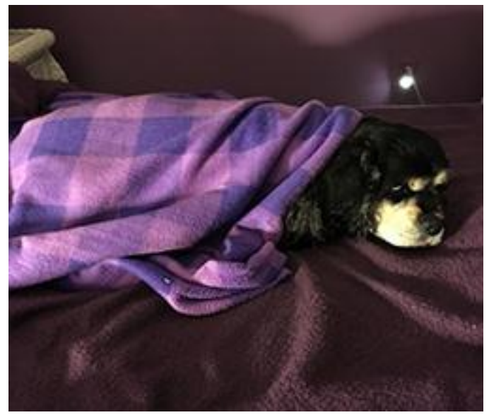
Brigit ready for sleeping with her blanket on my bed